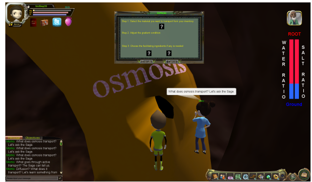
Figure 3: The virtual companion is showing curiosity towards the novel concept osmosis by asking “What does osmosis transport? Let’s ask the Sage.”

In the virtual learning environment, learning concepts are visualized as virtual objects, the states of which are changed through actions. For example, the concept water is visualized as a water molecule object in the virtual world, and the location of water changes from ground to root if the action osmosis is applied on the water molecule object. Learning goals can be achieved by following a correct plan of actions. For example, to complete the goal bring water into root , the correct plan is a_1 : collect water molecules , a_2 : collect partially permeable membrane , a_3 : adjust water ratio , and a_4 : osmosis . The virtual learning environment provides knowledge points that can be learnt by human learners to form