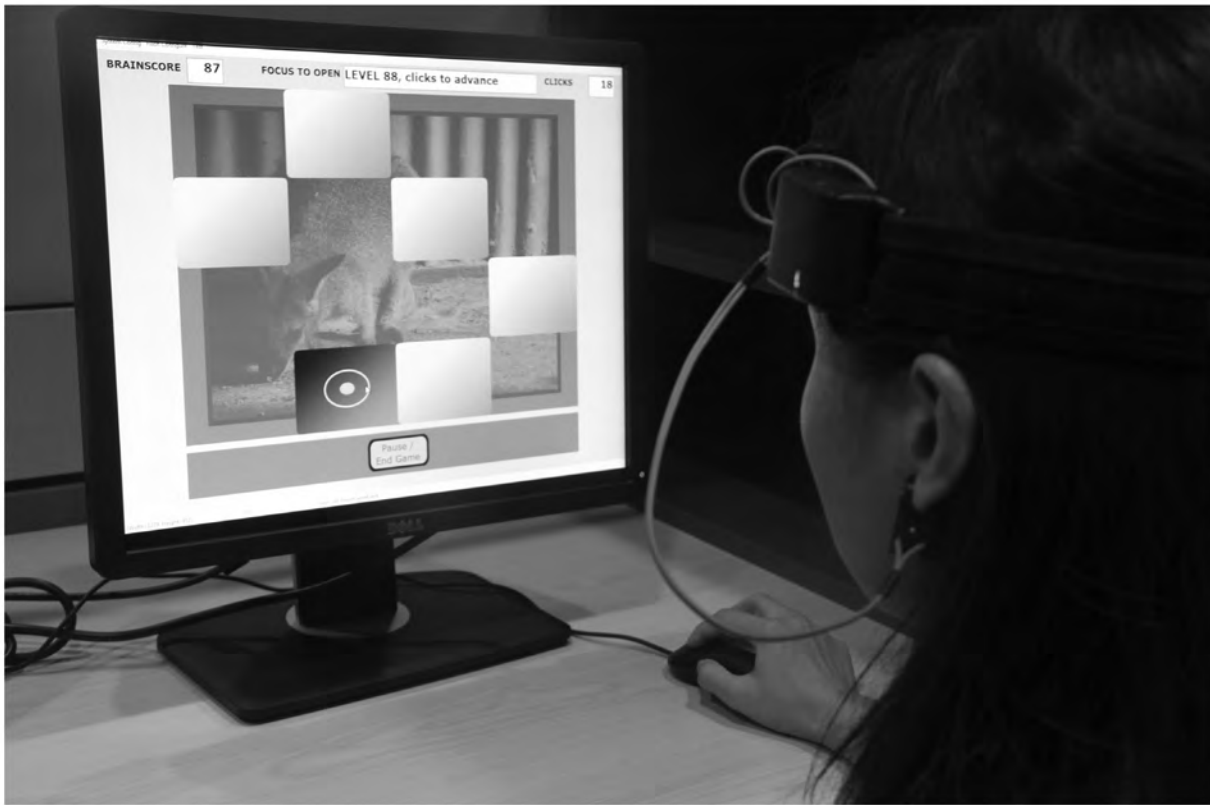
Figure 2. A model engaged in the Brain Computer Interface (BCI) memory and attention training game system. The model has given written informed consent, as outlined in the PLOS consent form, to publication of her photograph. doi:10.1371/journal.pone.0079419.g002

score at week 8 from week 1. Acceptability rate was defined as proportion of participants whose rating score to the whole system was greater than 4 (scale range 1–7).