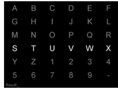
Figure 1. FD-Speller

In this speller, a subject was presented with a six by six matrix of characters (see Figure 1). The subject's task was to focus his attention on alphanumeric symbols in the matrix, one at a time. Rows and columns of this matrix were successively and randomly intensified for 100 milliseconds (ms), followed by 80 ms of non-intensification. Two out of twelve intensifications of rows and columns contained the desired character (i.e., one particular row and one particular column). EEG signal was sampled at 250Hz. 25 channels around central and parietal scalp were selected from all 64 channels we used to acquire EEG data.